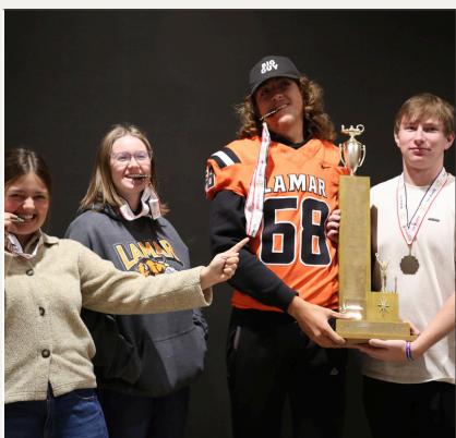
Lamar A 1st place winners

We extend our thanks to all participating schools, coaches, and volunteers who made this event a success. Their commitment to academic excellence and student development is what makes events like this possible. LCC remains proud to serve as a hub for intellectual engagement and community connection. We look forward to welcoming even more teams and talent in 2026!