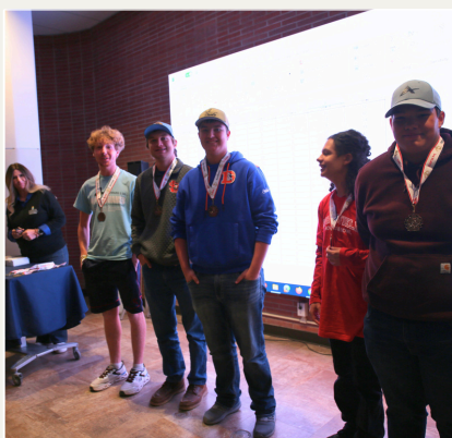
Karval 2nd place winners